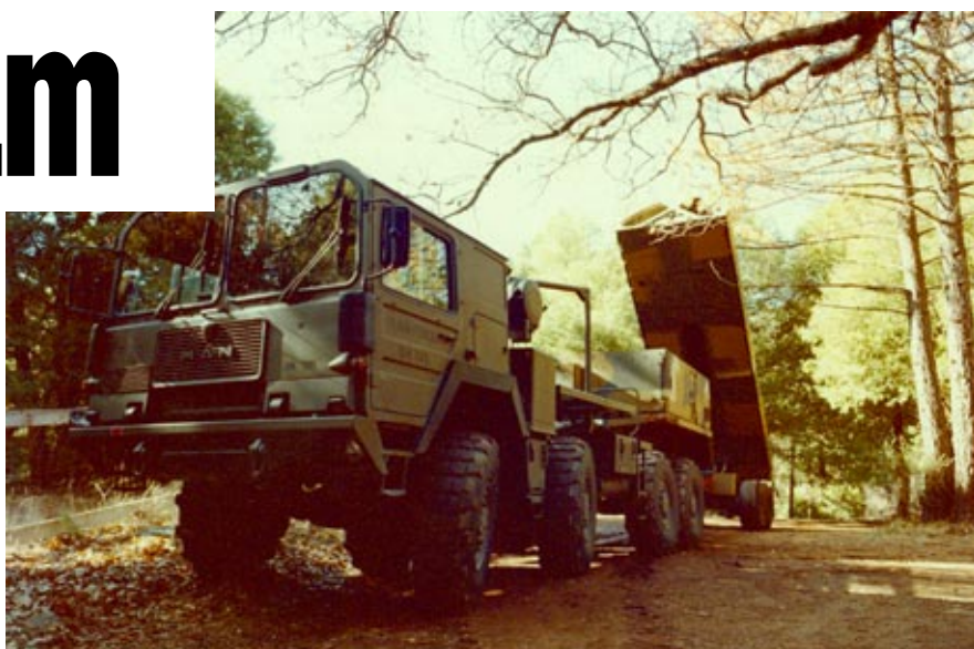
The Ground Launched Cruise Missile, with its combined transport and launch vehicle shown here, had a short operational life but proved to be an effective counter to Soviet SS-20 intermediate-range missiles.

O N JULY 1, 1982, USAF's 501st Tactical Missile Wing was activated at RAF Greenham Common in Great Britain. That step—taken 20 years ago this month—marked the start of what would prove to be a major political upheaval in Europe. Noisy protesters came early for the arrival of the wing's first batch of Ground Launched Cruise Missiles. However, US troops brought them in late at night, as the protesters slept.