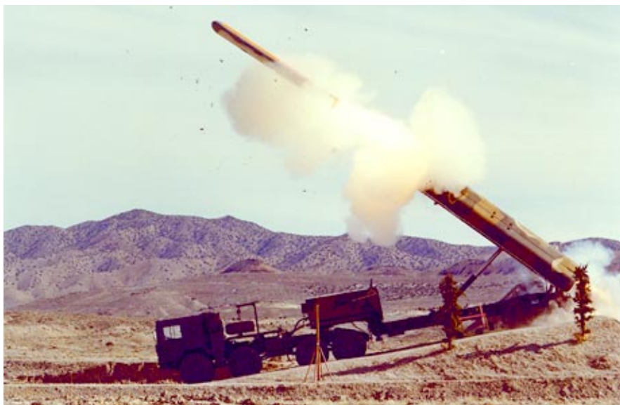
In a crisis, the GLCM system would be deployed to secret, presurveyed launch sites. At top, a camouflaged GLCM unit was hard to spot. Here, a GLCM was fired during a test launch in the US.

ter launch codes received by satellite. Once authorized, the officers would have simultaneously pressed “execute” buttons.