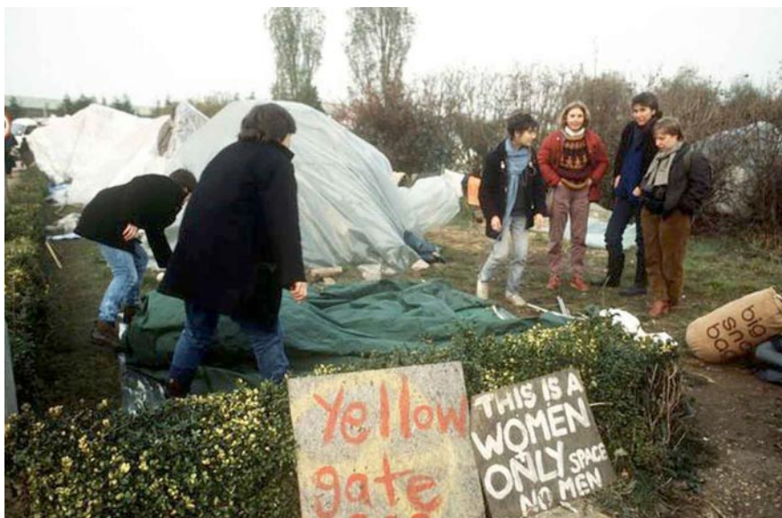
Anti-nuclear protesters feared GLCMs would destabilize the West. By 1981 they established a permanent "peace camp" outside the main gate of Greenham Common.

The GLCMs also represented an area of NATO technological superiority. At the time, Soviet weapons-